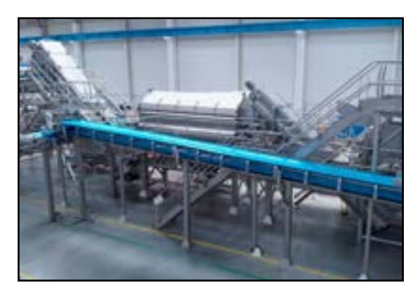
Sealing of potato steam peeler application was unreliable and costly.