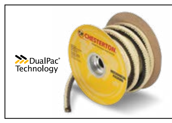
Figure 1: Chesterton DualPac Technology results in a braided packing with distinct benefits on each side.

Technical data reflects results of laboratory tests and is intended to indicate general characteristics only.